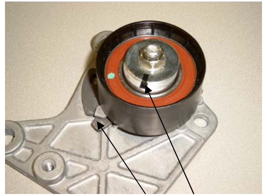
Fig. 7 D F

To lock the tensioner, position the open oblong hole in the base plate of the tensioner on the pin on the bracket (Fig. 6). When the belt and the tensioner are replaced following OE guidelines (1) and after two engine revolutions, then the pointer ( D ) has to be in the middle of the "V" in the base plate of the tensioner ( E ). At that moment the two black marks ( F ) will also be aligned. Only then the tensioner is correctly installed.