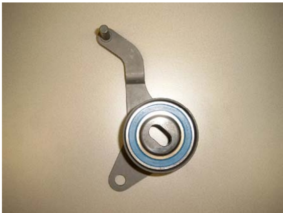
Fig. 1a OE ref. 5636724

Fig.1b shows how the base plate of the old tensioner is placed under the bottom leg of the engine support bracket. The new tensioner does not have such a base plate.