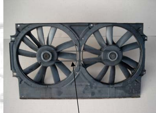
Fig. 2: PJ belt

In case additional cooling is needed (cars with air conditioning, with a factory installed tow bar, for taxis, etc), a second fan is installed, in order to pull more cooling air through the radiator. This second fan is then often driven from the first by a 2 or 3 rib PJ belt.