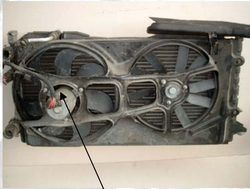
Fig. 1: Electrically driven fan

More recently, these small Micro-V belts were introduced in the automotive industry, where the main applications are ventilator (fan) drives. Usually the basic engine configuration only has 1 fan, which is electrically driven (system installed on radiator) (Fig. 1).